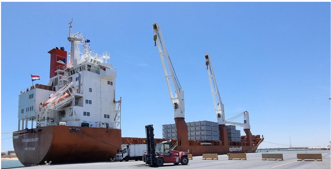
Figure 1 Hillgrove’s rotainers arriving at Port Adelaide

Hillgrove Resources Limited ACN 004 297 116